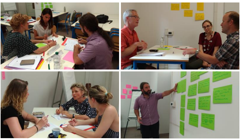
EDEN Partners during the co-creation workshop at the University of Udine, Udine (Italy)

During the meeting, the partners had the opportunity to visit the CSAF - <u>Simulation Center</u> and <u>High Education of Udine University</u> a modern and well-equipped simulation laboratory used for skill training, guidance, and simulation.