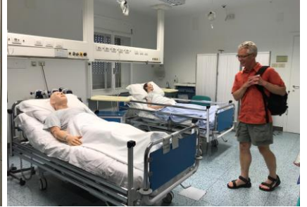
EDEN Partners tour at Simulation and Education Center, Udine University Hospital (Italy)